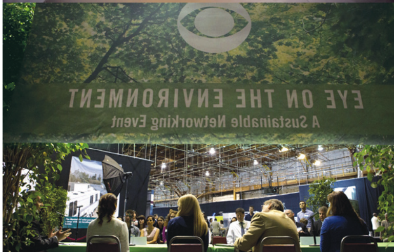
Top: Participants at the 5th Annual Eye on the Environment Event at CBS Studio Center. Bottom: Panel discussion on reducing carbon footprints.